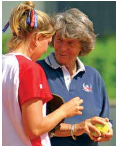
Women’s softball coach at Florida Atlantic University.