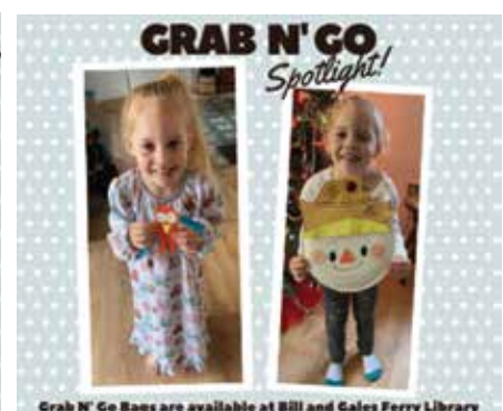
Some of our 1000 book readers and Grab N' Go participants.